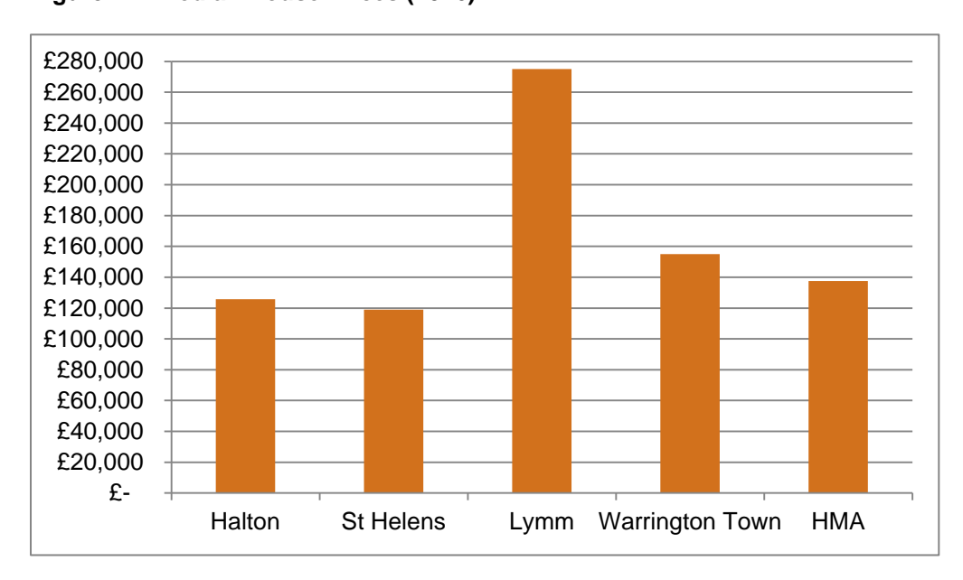
Figure 1: Median House Prices (2016)